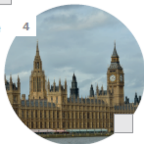
Palace of Westminster