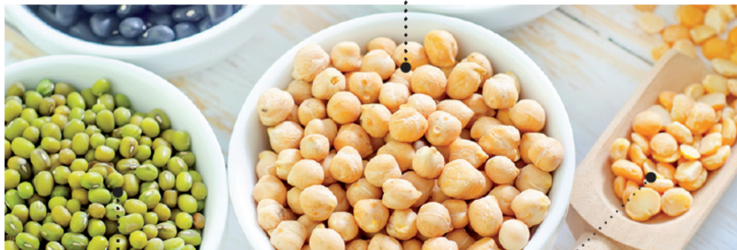
garden pea [ˌgɑ:dən 'pi:]